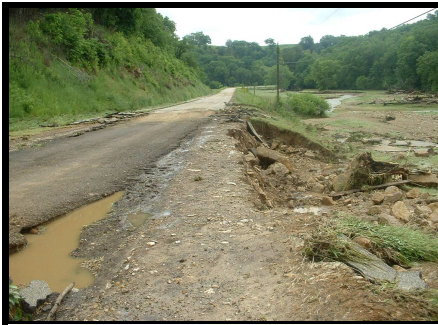
July 2008, Flood Damage to CTH O

Highway System. The engineer solves problems encountered during maintenance, designs replacement structures and road realignments and helps with the administration of permits and right-of-way acquisition. The mechanics and the welder spend their time maintaining all the various equipment that is required to complete our work here at the Highway Department. They work under the direction of Jeanie Morgan, Shop Foreman. All of these employees work together to fight winter storms. During the 2007-08 winter season the crew worked extremely hard to clear the highways of a record seasonal snowfall. Lets hope next winter is a bit milder.