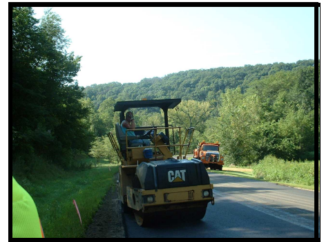
Rooster Kirschbaum on the roller

The Grant County Highway Department also maintains the State Highway System. There are 259 miles of State Highways, within Grant County, that are maintained by 11 patrolmen. The duties of the state patrolmen are similar to those of the county