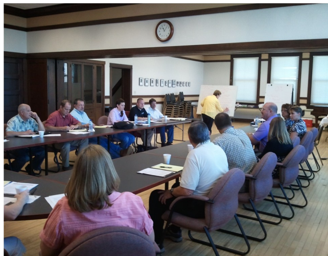
Budget Workshop. Grant County Department Heads working together on 2013 Budget.